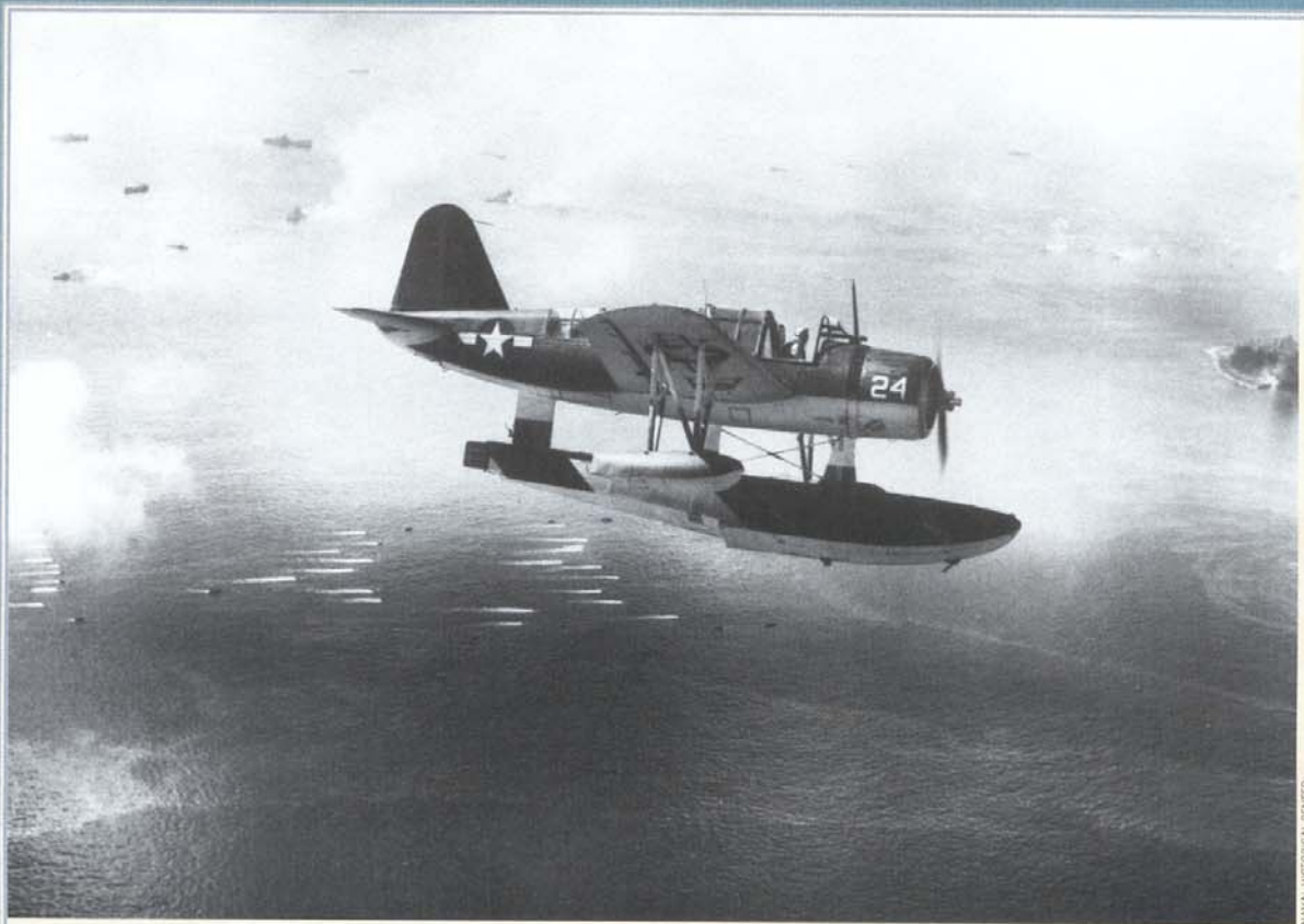
NAVAL HISTORICAL CENTER