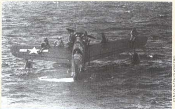
US NAVY, NASM (S) #00092801