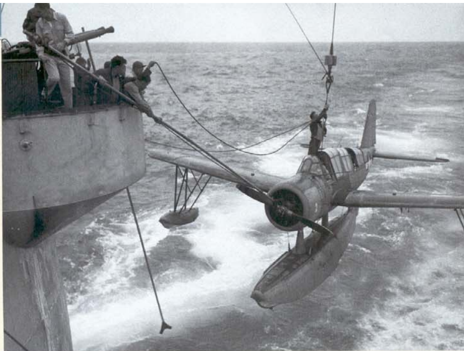
A pilot has attached the hook from a shipboard crane so the Kingfisher can be hoisted onto the deck (left). Before a recovery (opposite), the pilot taxied, sometimes in rough water, to engage a "sled" with a spring-loaded hook on the airplane's main float.